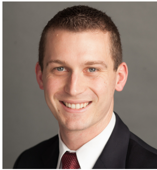
Ryan Loofbourrow Klein Solomon Mills PLLC