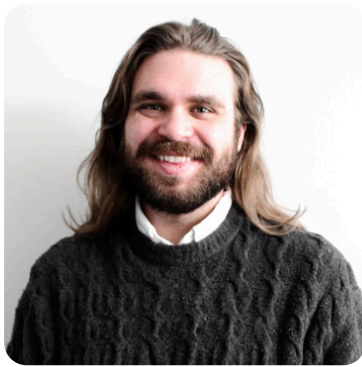
Brady Shipman Community Resource Center