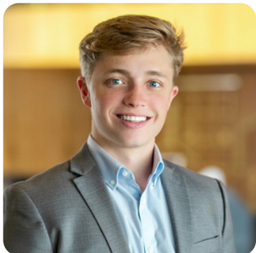
Joey King BluWave